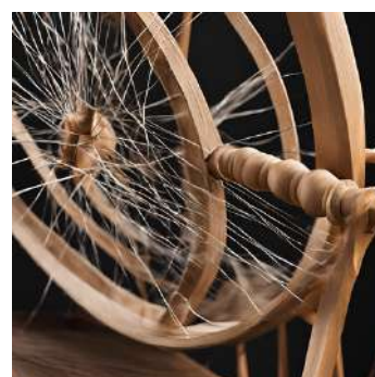
top: 'Kumihimo braid' middle left: 'weaving Alpaca' near left: 'spinning fibre'