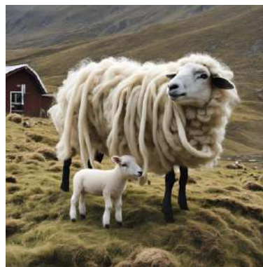
'felted yarn sheep'

This one was 'Handspinners and Weavers Guild' but I only see weavers! (if you look at her fingers you can see the evidence of AI, which often struggles with hands).